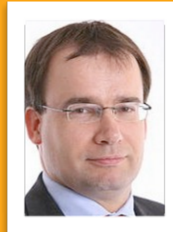
Gareth Thomas, Co-operative Party Chair